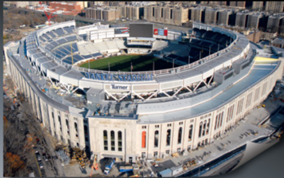
New Yankee Stadium Bronx, NY 2009

Structal-Heavy Steel Construction offers steel building solutions that meet construction industry challenges.