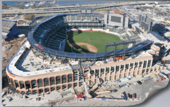
Citi Field Stadium Flushing, NY 2009