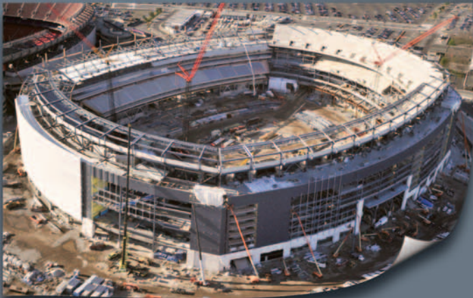
New Meadowlands Stadium East Rutherford, NJ 2008